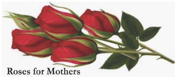
Roses for Mothers

Advance tickets Available from any board member