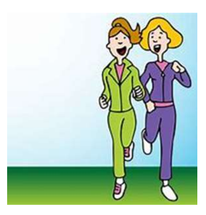
Exercise Class 26 Sessions Beginning Sept. 18

Please be aware that the children are back in school and sometimes forget to check both ways.